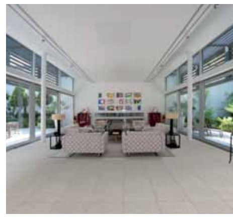
Wicanders cork floorings are Greenguard Gold Indoor Air Quality Certified

Independent life cycle analysis concludes that each cork stopper is responsible for retention of 112 grams of CO<sub>2</sub>, in stark contrast with the carbon emissions caused by plastic closures (37.2g CO<sub>2</sub>/closure).