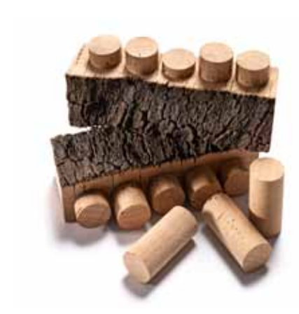
A cork stopper is the only closure that combines high performance and sustainability credentials

After being ground into small granules, the recycled cork enjoys a new lease of life and may be used in floor and wall coverings, insulation, sports equipment, fashion items ... but will never be used in stoppers again. Recycling, in addition to increasing reuse of the raw-material, makes it possible to extend the life cycle of cork and associated environmental benefits, in particular their remarkable CO<sub>2</sub> retention capacity.