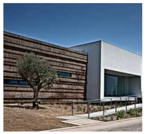
Expanded insulation cork board, a 100% natural material for sustainable construction

With virtually unlimited durability, retains all its features throughout the product's working life and is fully recyclable.